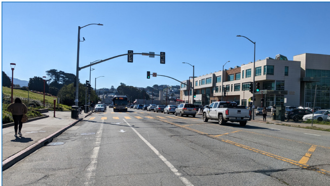
Above: Frida Kahlo Way Below: Judson Avenue

Project limits: Foerster Avenue and Cloud Circle