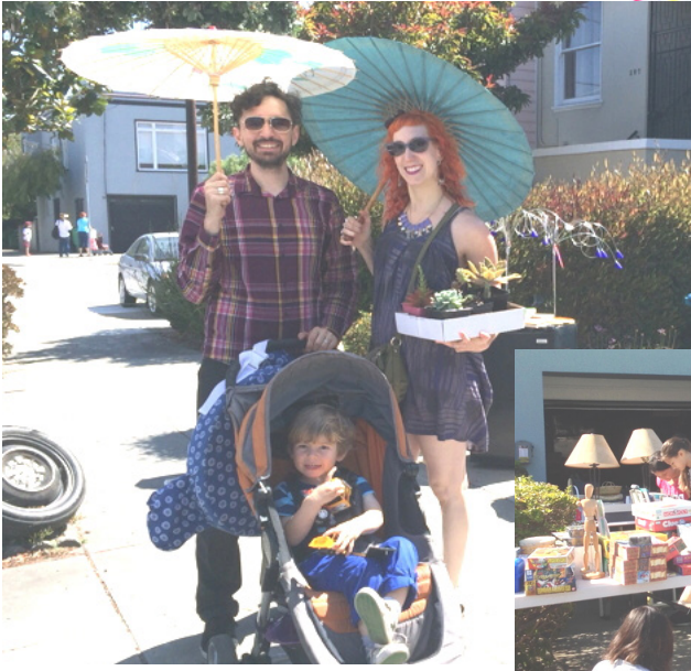
Family fun on Sunnyside streets