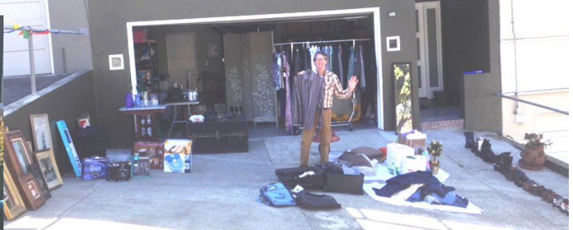
Troy's elegant sale on Mangels Ave