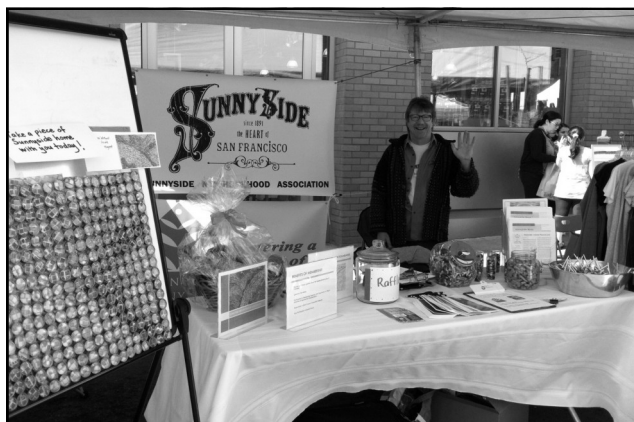
At SNA's booth at this year's Glen Park Festival SNA recruited 18 new households as SNA members.

Our booth was especially eye-catching thanks to the bottle cap magnet mosaic of Sunnyside Elementary's school-front mosaic. It was a big hit and everyone enjoyed taking a piece of Sunnyside home with them!