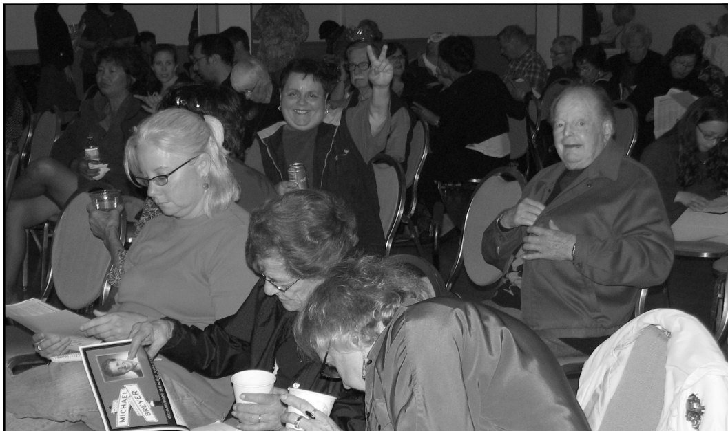
Some of the more than 130 neighbors who attended the May SNA meeting. More photos on page 5.

2013 Meetings February 7 May 6 August 5 November 4