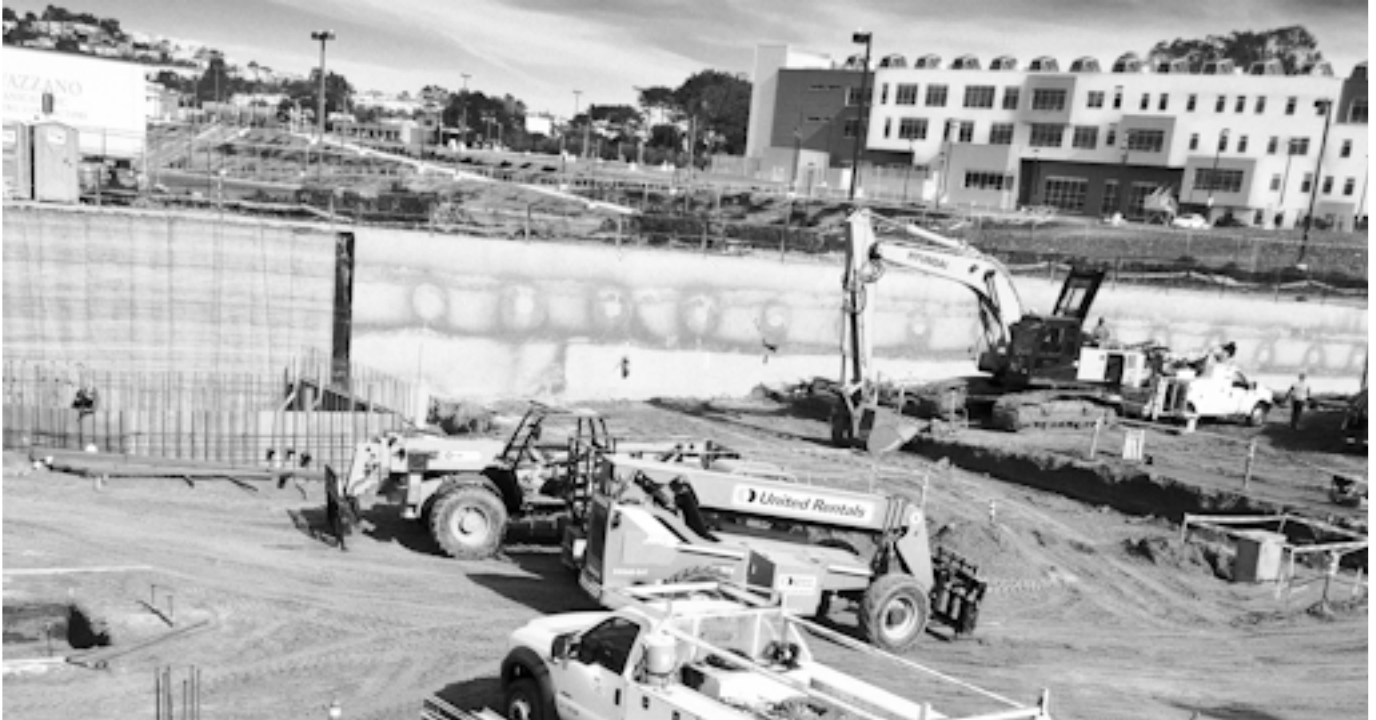
Construction of a new Whole Foods outlet continues along the Ocean Avenue site where Kragen Auto Parts once stood.