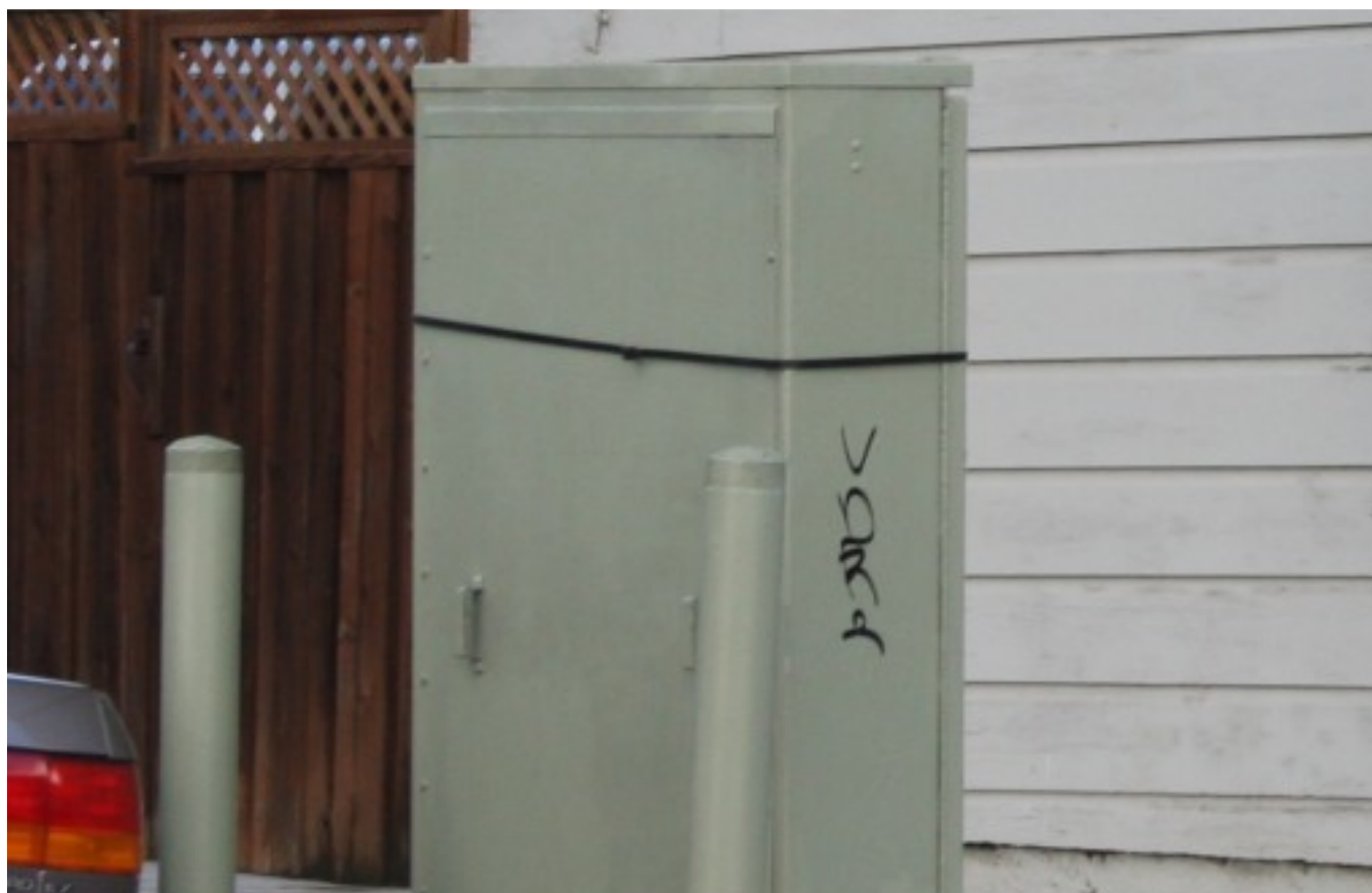
An AT&T utility box on the corner of Flood and Genessee.