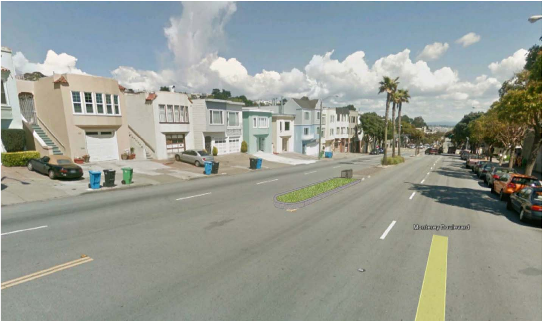
MONTEREY BLVD MEDIAN WITH LANDSCAPING