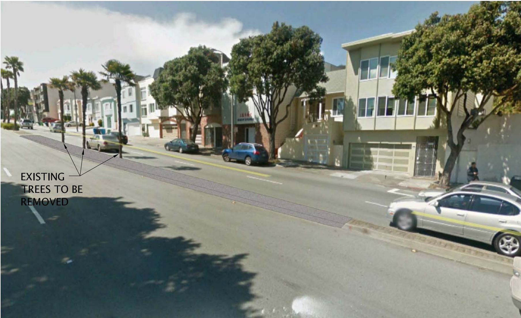
MONTEREY BLVD MOUNTABLE CONCRETE MEDIAN